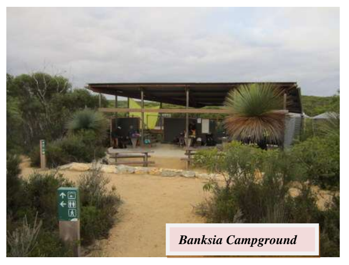
Day 3: Thursday 27<sup>th</sup>, Cape du Couedic to Sanderson Bay and Banksia campground

The day dawned partly cloudy and we left the Hakea camp site at 8:30 am. By mid morning we had reached the junction to the Remarkable Rocks. A geological natural landmark sculptured by the elements over 500 million years.