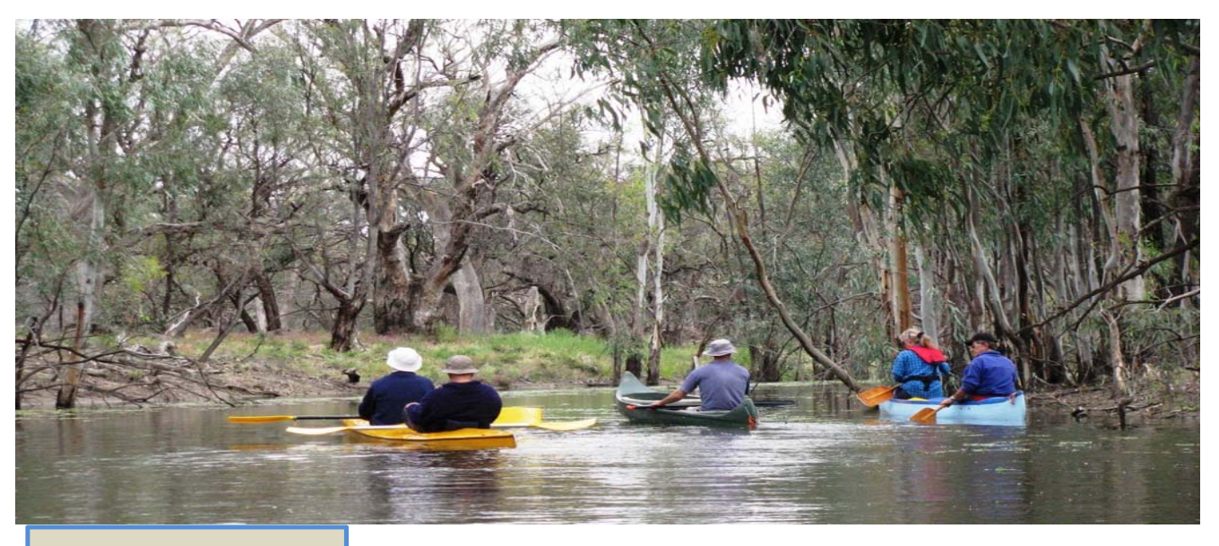
Paddling Chalka Creek