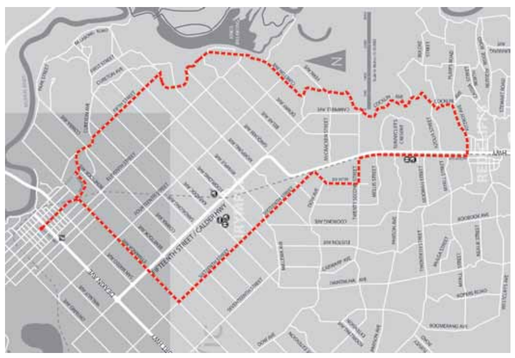
Street map of The Spider's Web Ride.