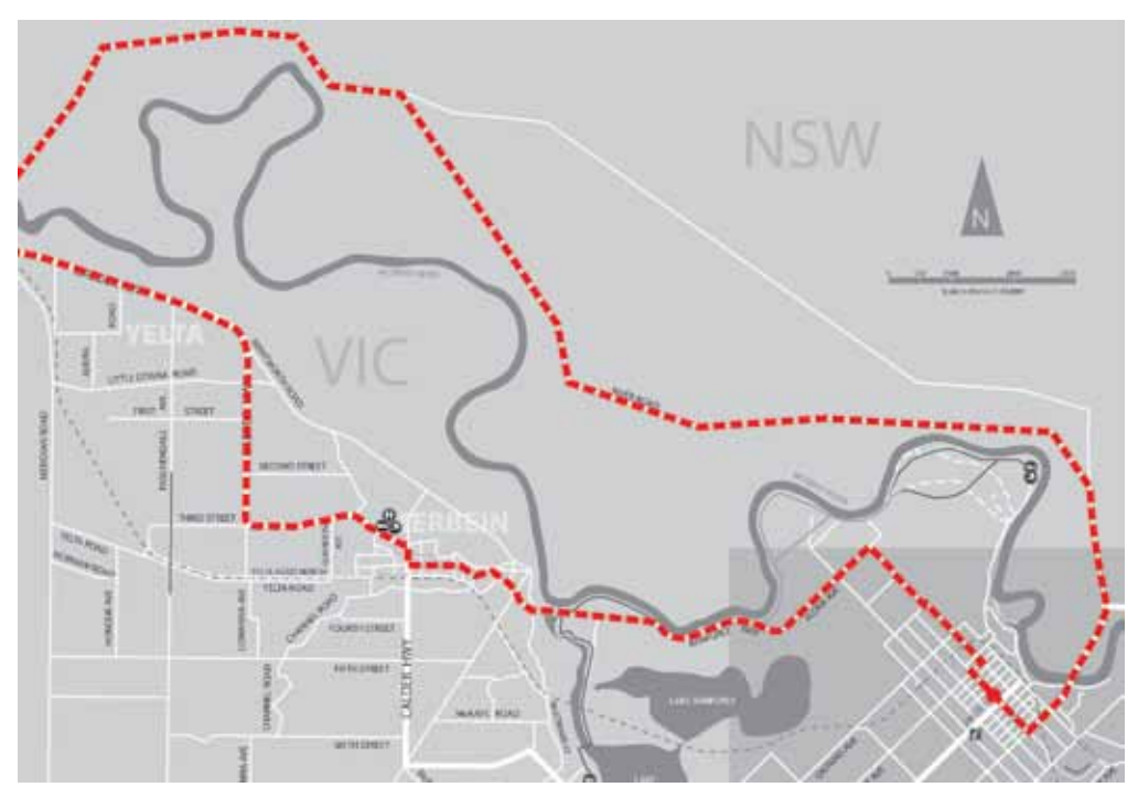
Street map of the Bridge to Bridge circuit.