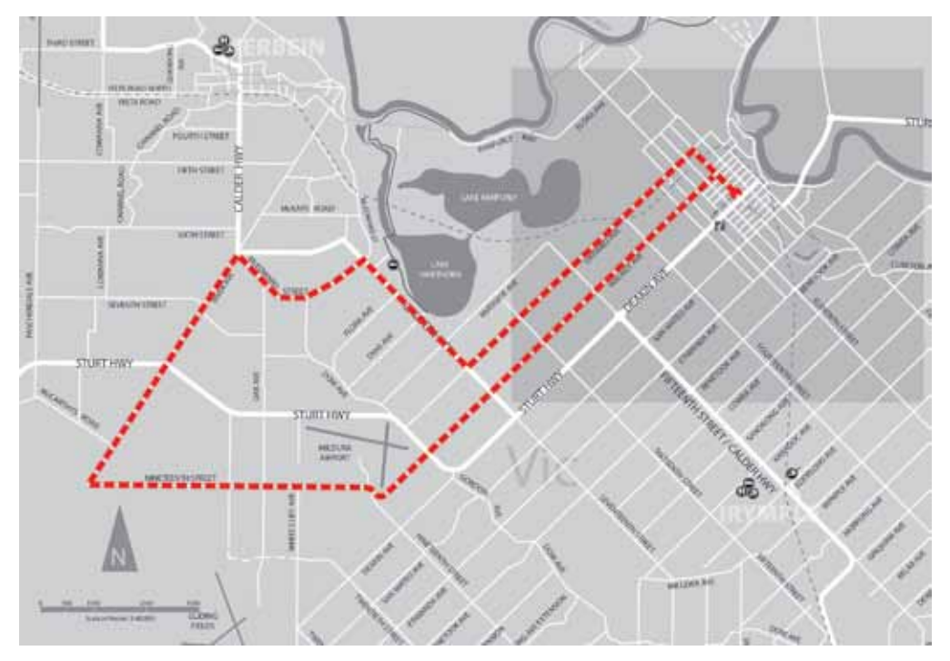
Street map of the Airport Loop.