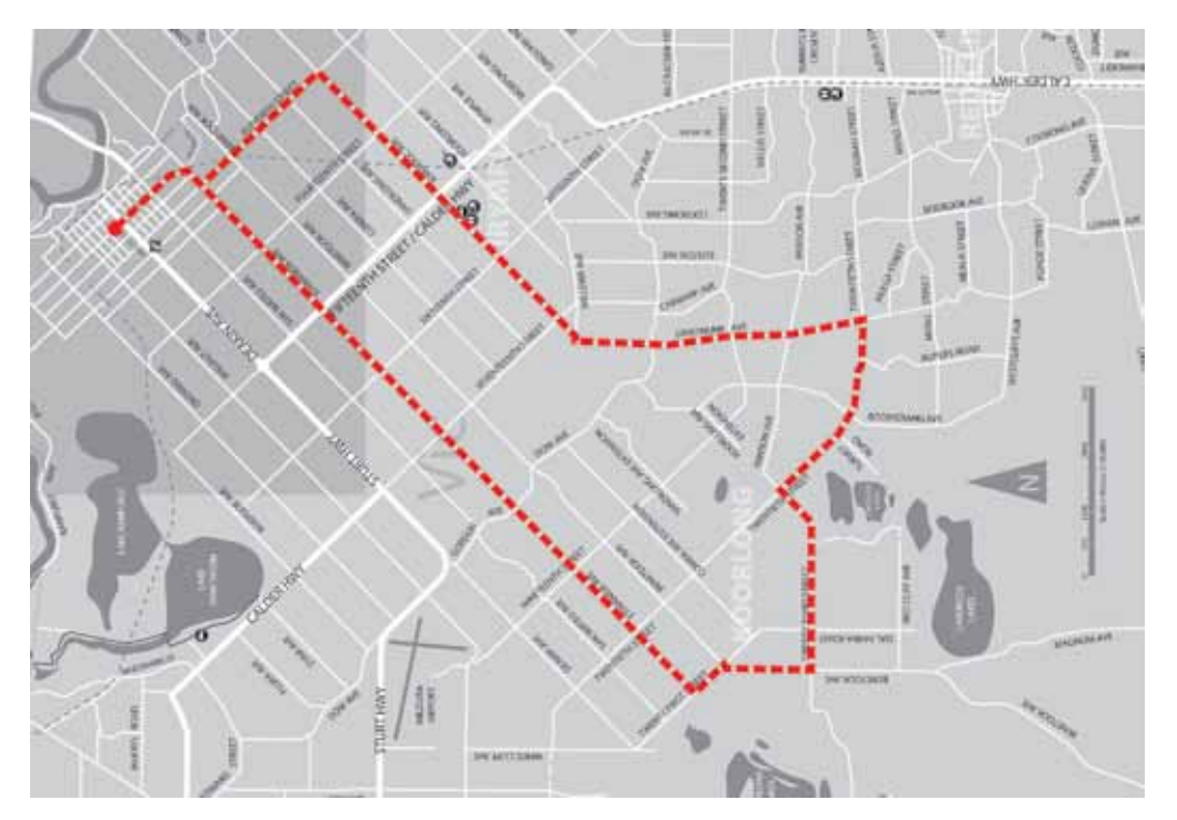
Street map of the Cardross Loop.