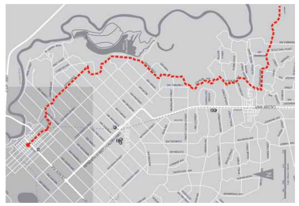
Street map of Nangiloc Tavern Ride.

• Retrace your steps back home to the starting point.