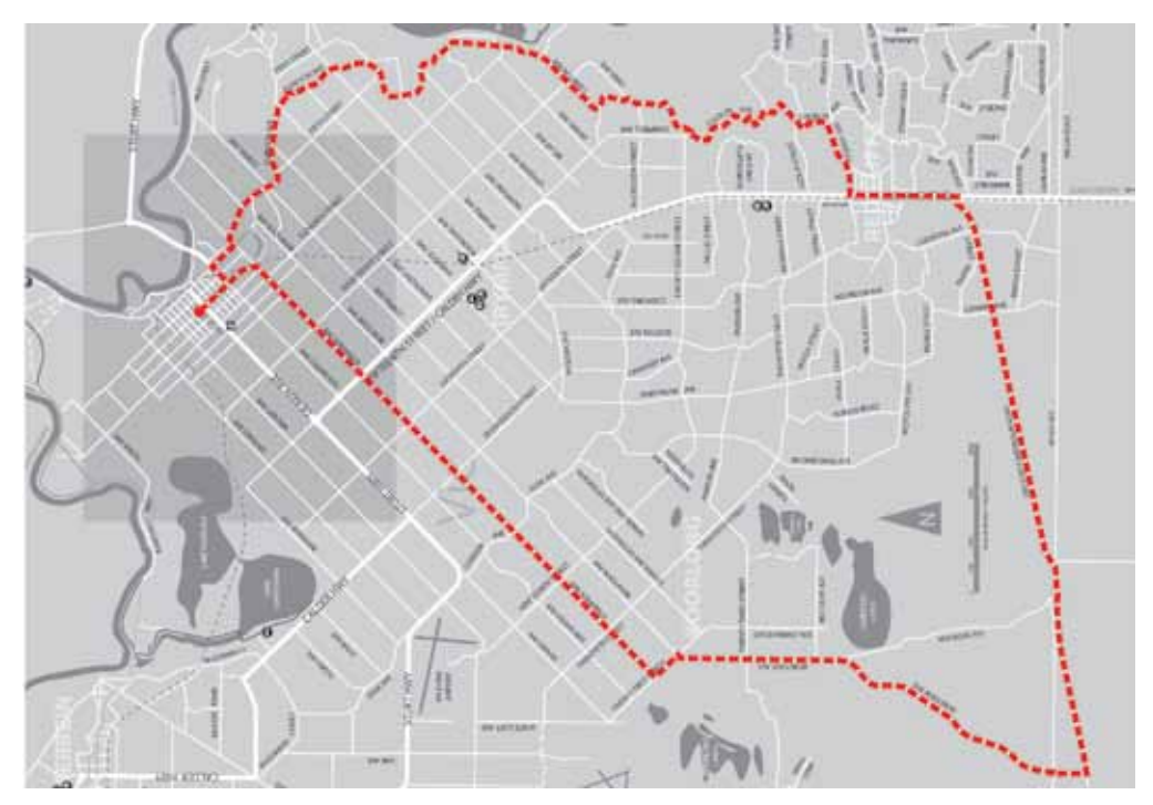
Street map of The South West Loop.