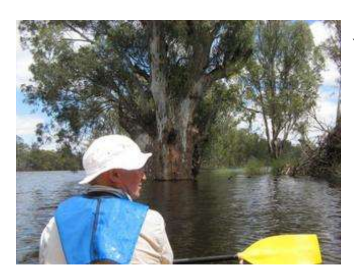
Written by Dick

gave a rare snapshot of this region where the waters rather than idling to the sea, showed they had the controlling influence for the moment. It was a fascinating time to come here.