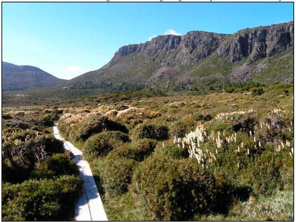
West Wall & Damascus Gate

We immediately are surrounded with areas of verdant green moss growing amongst the masses of cushion plants and flowing Scoparia. With high rocky faces towering beside, the setting becomes a living postcard. The amazing cushion plants are endemic to the alpine regions. They grow ever so slowly from a tap root and can endure for hundreds of years. Being ever so delicate on their surface, they develop a very hard interior. The aptly named Lake Salome on our left glistened in the morning light. As we moved through this wondrous plant community we get a better view of David's Peak high up on our right hand side.