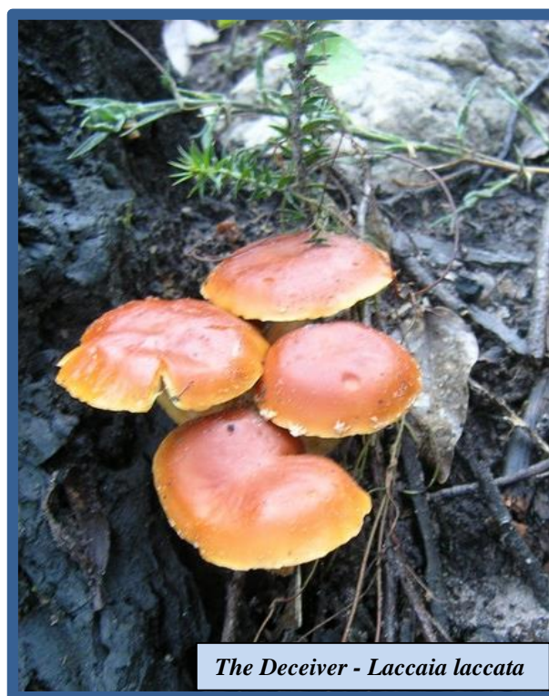
The Deceiver - Laccaria laccata