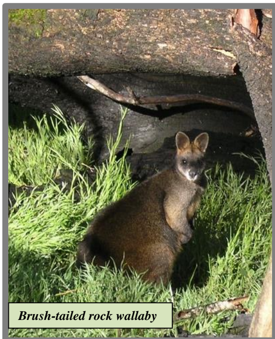
Brush-tailed rock wallaby