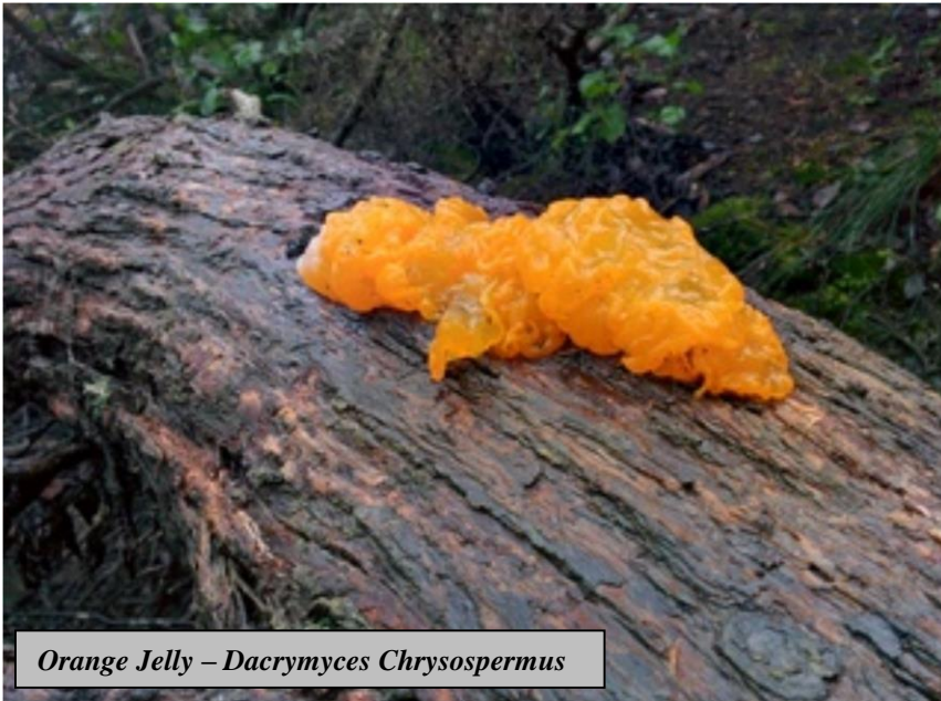
Orange Jelly – Dacrymyces Chrysospermus

And some gooey, soft blobs of high-viz orange fungus oozing quietly on dead banksia branches.